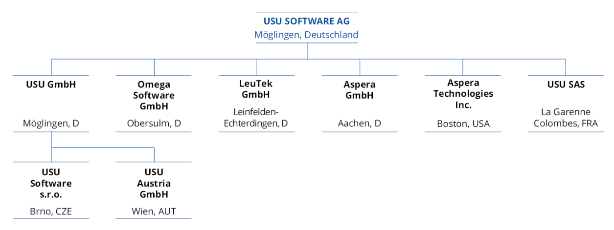
The USU Software AG and its subsidiaries

As the parent company of the Group, USU Software AG, Möglingen, Germany, directly or indirectly participates in the following operational companies: Aspera GmbH, Aachen, Germany; Aspera Technologies Inc., Boston, USA; LeuTek GmbH, Leinfelden-Echterdingen, Germany; Omega Software GmbH, Obersulm, Germany; USU GmbH, Möglingen, Germany; USU Austria GmbH, Vienna, Austria; USU SAS, La Garenne Colombes, France; USU Software s.r.o., Brno, Czech Republic. USU Software AG also has shareholdings in Openshop Internet Software GmbH, Möglingen, Germany, USU (Schweiz) AG i.L., Zug, Switzerland, and USU Consulting GmbH i.L., Sursee, Switzerland, which are no longer operational.